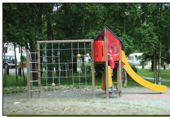
The playground needs repair and replacements