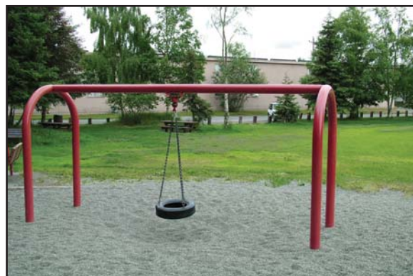
The tire of the tire swing needs replacement

For a complete directory of Report Card results for neighborhood parks, go to www.AnchorageParkFoundation.org/projects/reportcard.htm