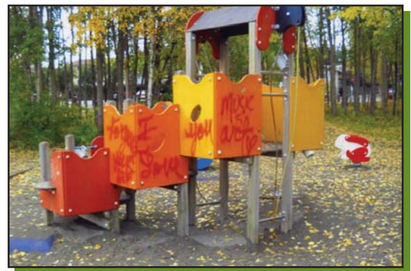
Play equipment needs to be re-painted to cover graffiti