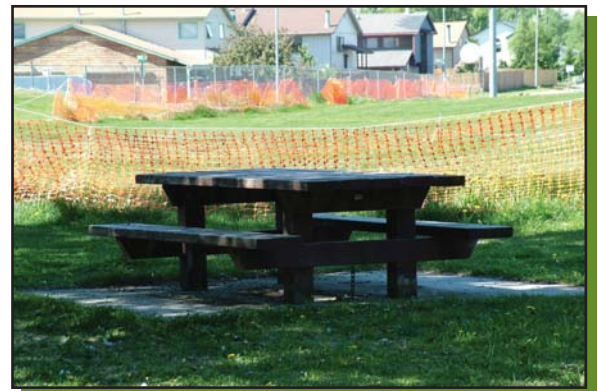
Picnic tables and benches need to be re-painted

For a complete directory of Report Card results for neighborhood parks, go to www.AnchorageParkFoundation.org/projects/reportcard.htm