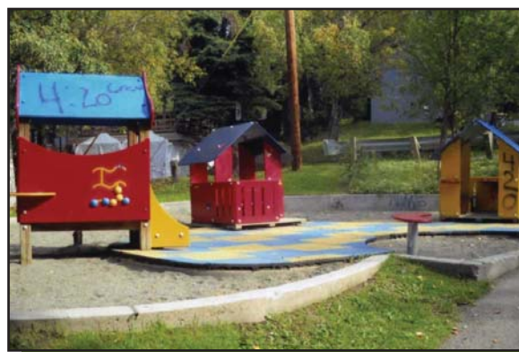
The tot lot has been tagged with graffiti