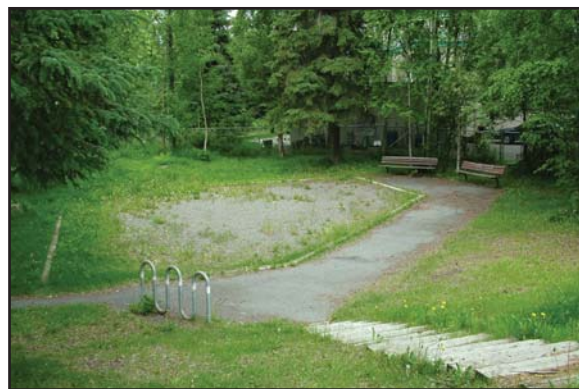
The play equipment was taken out and the grass never grew back

For a complete directory of Report Card results for neighborhood parks, go to www.AnchorageParkFoundation.org/projects/reportcard.htm