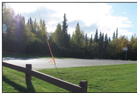
Neighbors request better maintenance and repair of the basketball court