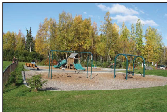
Graffiti needs to be removed from the play equipment

For a complete directory of Report Card results for neighborhood parks, go to www.AnchorageParkFoundation.org/projects/reportcard.htm