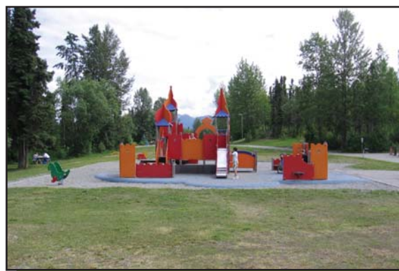
Some pieces of play equipment are broken and need replacement