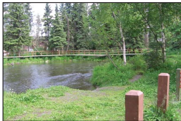
A lot of beaver damage in green space

For a complete directory of Report Card results for neighborhood parks, go to www.AnchorageParkFoundation.org/projects/reportcard.htm