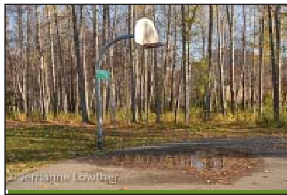
Basketball court drainage problem

For a complete directory of Report Card results for neighborhood parks, go to www.AnchorageParkFoundation.org/projects/reportcard.htm