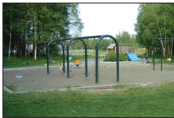
Community would like engineered wood fiber under swings