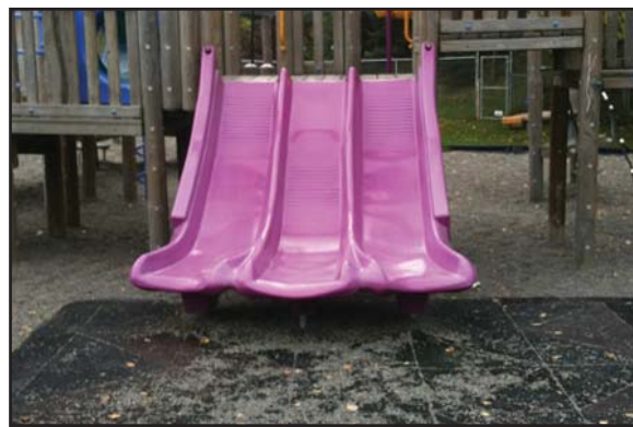
Surface very worn-down

For a complete directory of Report Card results for neighborhood parks, go to www.AnchorageParkFoundation.org/projects/reportcard.htm