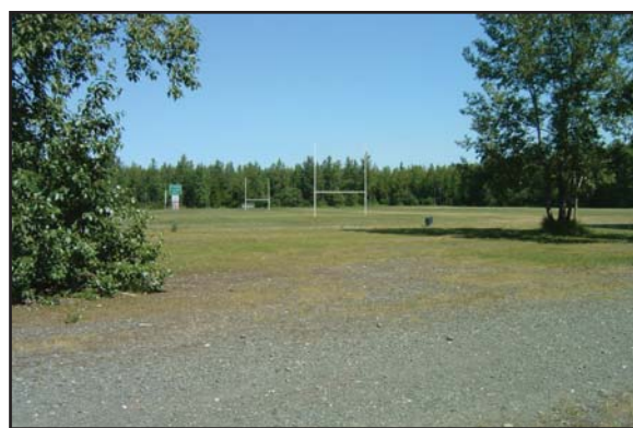
The active areas need repair and better maintenance

For a complete directory of Report Card results for neighborhood parks, go to www.AnchorageParkFoundation.org/projects/reportcard.htm