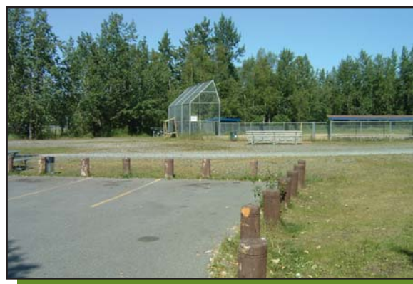
The ballfields need repair