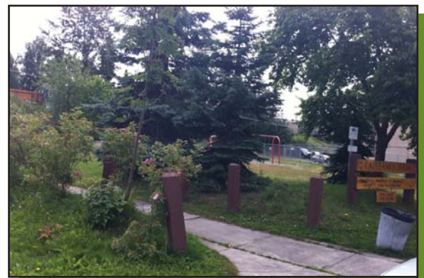
Rose bushes and trees need to be pruned