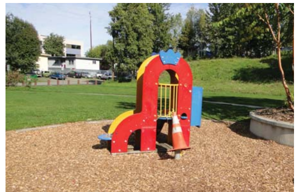
Repair and / or replace tot lot

For a complete directory of Report Card results for neighborhood parks, go to www.AnchorageParkFoundation.org/projects/reportcard.htm