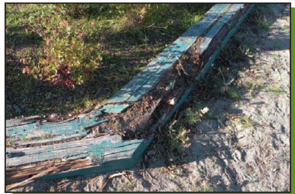
Timber retention walls are in poor condition

For a complete directory of Report Card results for neighborhood parks, go to www.AnchorageParkFoundation.org/projects/reportcard.htm