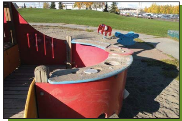
Playground needs to be updated

Community members expressed a desire to make Fairview Lions more of a destination park in order to promote it more. They would really like to see some new, creative play equipment that would attract kids more. They really enjoy the community gardens, but report that there should be some fencing around the garden, as well as benches inside. Homeless camping and inebriates in picnic shelter continue to be an issue that needs discussion. Overall, park feels uninviting and depressed.