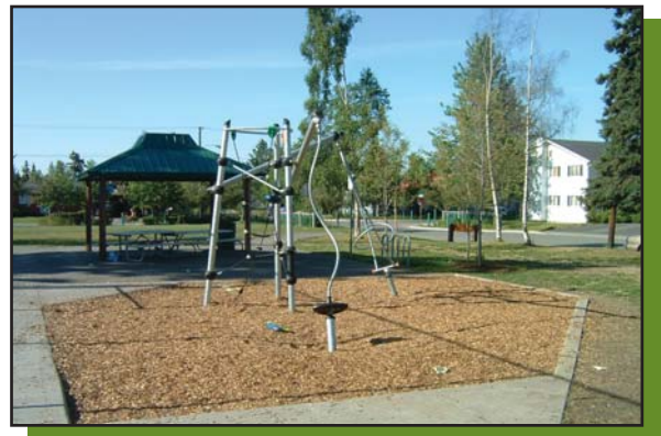
Remove trash and debris from playground

Community members reported concerns about graffiti, human waste, empty alcohol bottles, and drugs in the park. They would like to see the playground re-painted and dog stations and trash cans installed. People reported feeling unsafe in Fairview Park.