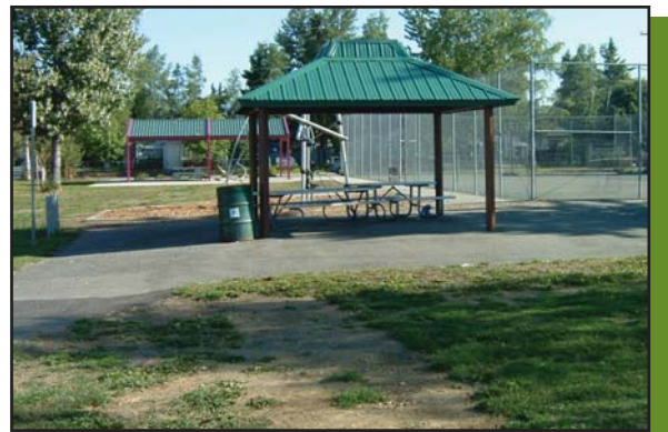
Trash cans need to be updated

For a complete directory of Report Card results for neighborhood parks, go to www.AnchorageParkFoundation.org/projects/reportcard.htm