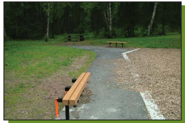
Turf areas are in need of repair