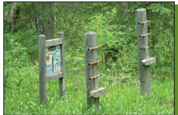
Fitness course is in poor condition

For a complete directory of Report Card results for neighborhood parks, go to www.AnchorageParkFoundation.org/projects/reportcard.htm