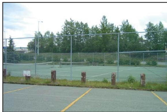
Updated tennis court

For a complete directory of Report Card results for neighborhood parks, go to www.AnchorageParkFoundation.org/projects/reportcard.htm