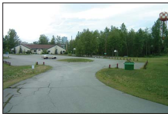
Numerous pavement cracks on the entrance drive