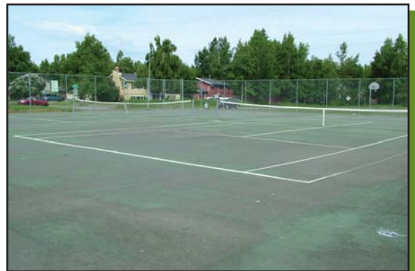
Tennis courts are old and in need of upgrade

For a complete directory of Report Card results for neighborhood parks, go to www.AnchorageParkFoundation.org/projects/reportcard.htm