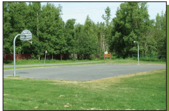
Basketball court not fully functional