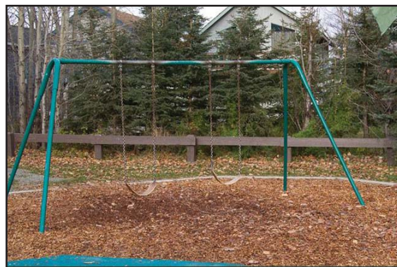
Community members pleased with the new engineered wood fiber surface

For a complete directory of Report Card results for neighborhood parks, go to www.AnchorageParkFoundation.org/projects/reportcard.htm