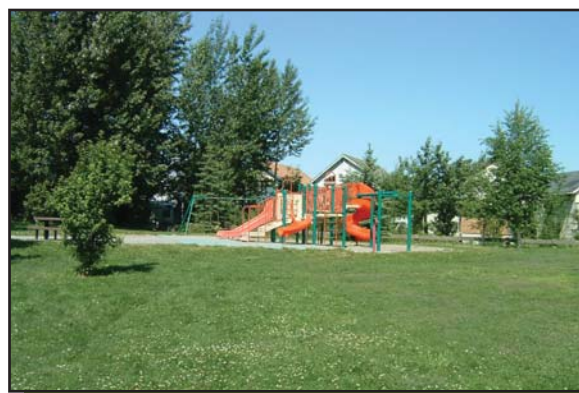
Damaged parts on the play equipment were replaced in Summer 2011