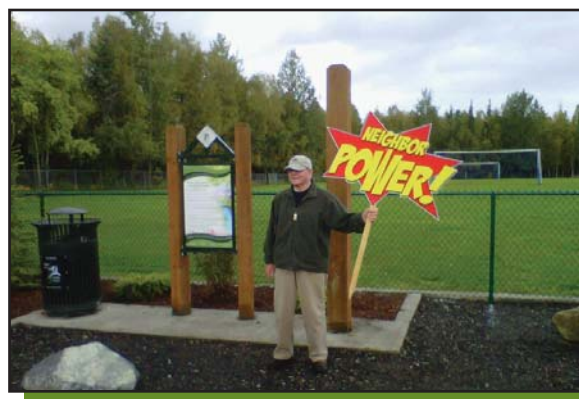
Neighbor shows off the new entry way complete with sign, fence, and trash can