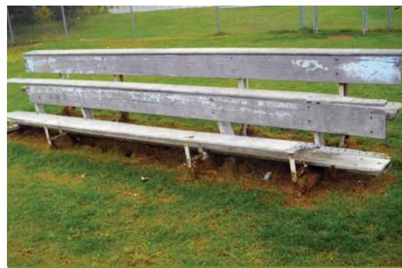
Wooden bleacher falling apart, should be replaced with a higher quality one

For a complete directory of Report Card results for neighborhood parks, go to www.AnchorageParkFoundation.org/projects/reportcard.htm