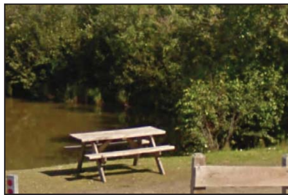
Provide new location for picnic tables

For a complete directory of Report Card results for neighborhood parks, go to www.AnchorageParkFoundation.org/projects/reportcard.htm