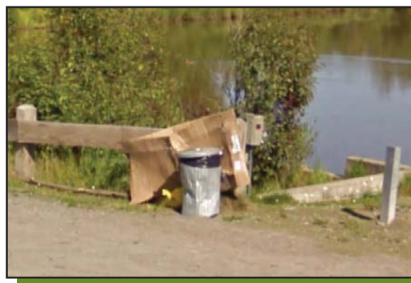
Update trash receptacle

Community members reported that the ponds and streams are littered with trash, and that the water in the ponds is dirty stormwater run-off. They saw evidence of people living in the park. They also noticed that geese and ducks come up to picnic tables expecting to be fed, so a sign prohibiting people feeding them might help. Overall the park is not particularly welcoming or informative.