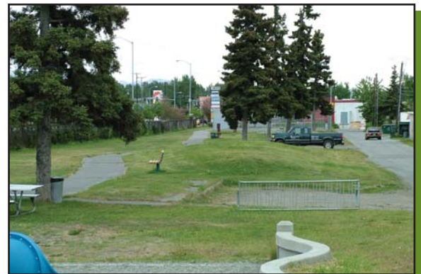
Trash cans should be replaced with the new standard

For a complete directory of Report Card results for neighborhood parks, go to www.AnchorageParkFoundation.org/projects/reportcard.htm