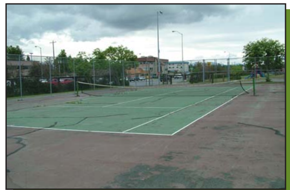
Community members would like to see a basketball court instead of tennis courts