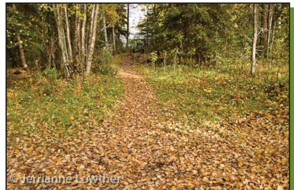
Informal trail back to Scenic Park Elementary could use some cleanup, tree thinning, maintenance

For a complete directory of Report Card results for neighborhood parks, go to www.AnchorageParkFoundation.org/projects/reportcard.htm