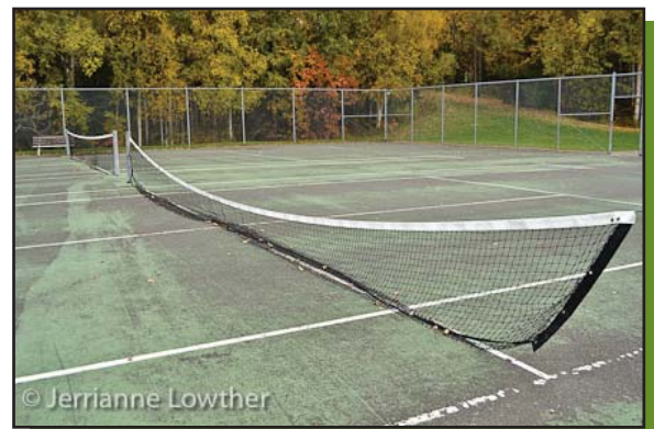
Scenic Park tennis courts need resurfacing, net drags on ground.