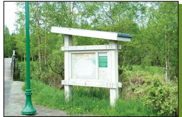
Kiosk is dated

For a complete directory of Report Card results for neighborhood parks, go to www.AnchorageParkFoundation.org/projects/reportcard.htm