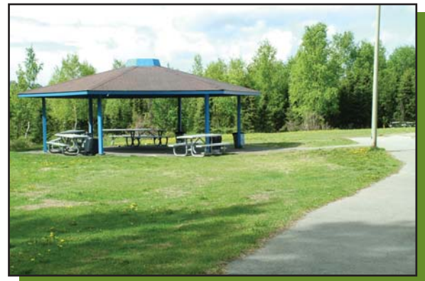
Turf areas are in poor condition near the picnic area