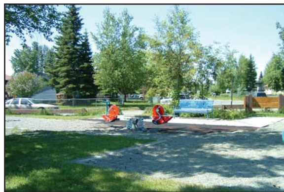
Neighbors request that graffiti be removed from the play equipment

For a complete directory of Report Card results for neighborhood parks, go to www.AnchorageParkFoundation.org/projects/reportcard.htm