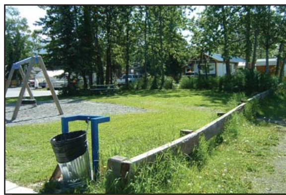
Trash cans need to be replaced