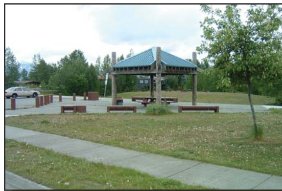
Park users identified needed improvements to most grass areas