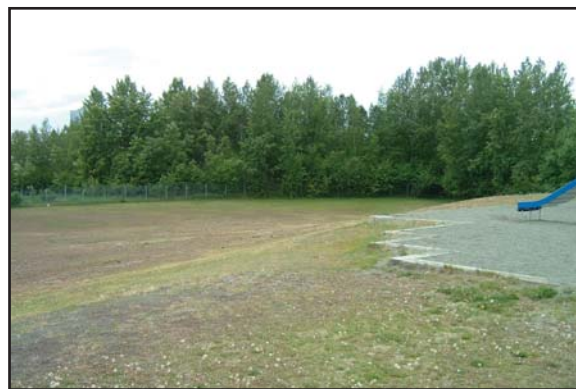
Active turf areas need to be replaced

For a complete directory of Report Card results for neighborhood parks, go to www.AnchorageParkFoundation.org/projects/reportcard.htm