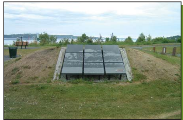
Turf is poor condition adjacent display