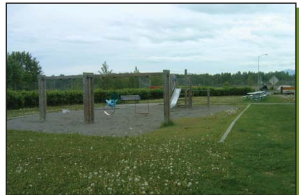
Playground needs to be weeded

For a complete directory of Report Card results for neighborhood parks, go to www.AnchorageParkFoundation.org/projects/reportcard.htm