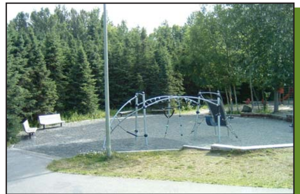
Black Spruce near playground should be thinned out

For a complete directory of Report Card results for neighborhood parks, go to www.AnchorageParkFoundation.org/projects/reportcard.htm