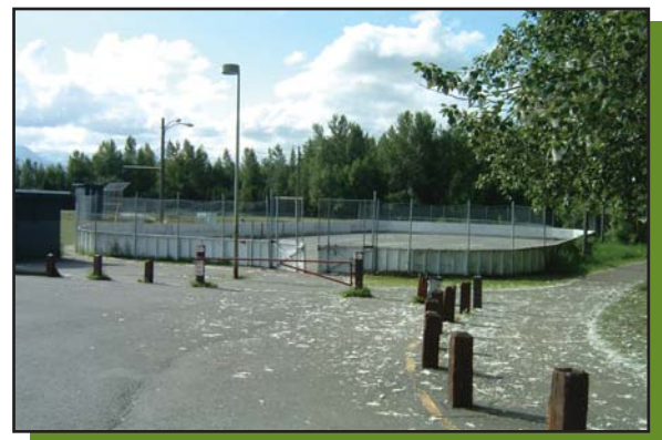
Bollards and Light poles need maintenance