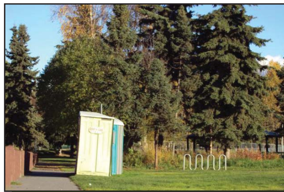
The port potties are at the north entrance to the park, and lack charm.