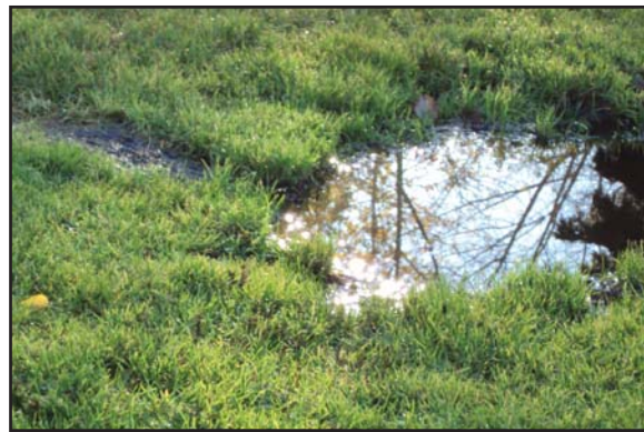
Some holes with standing water in the field

For a complete directory of Report Card results for neighborhood parks, go to www.AnchorageParkFoundation.org/projects/reportcard.htm