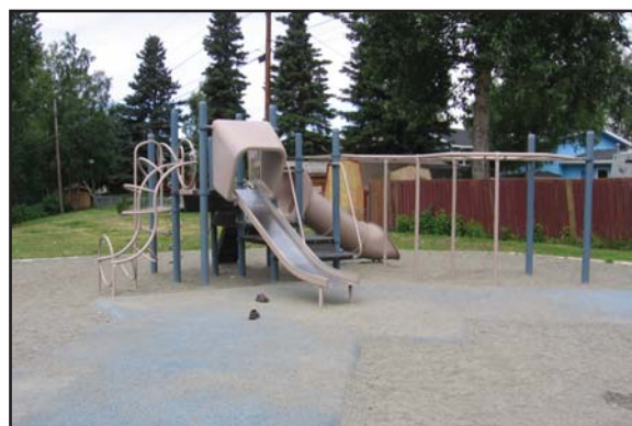
The playground could use a fresh coat of paint and engineered wood chips