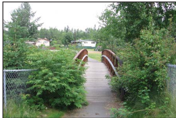
Plantings adjacent bridge could use some trimming

For a complete directory of Report Card results for neighborhood parks, go to www.AnchorageParkFoundation.org/projects/reportcard.htm