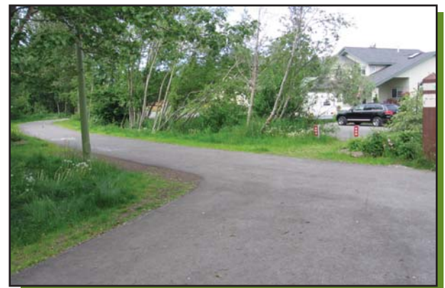
Improved sight lines are needed for user safety

For a complete directory of Report Card results for neighborhood parks, go to www.AnchorageParkFoundation.org/projects/reportcard.htm