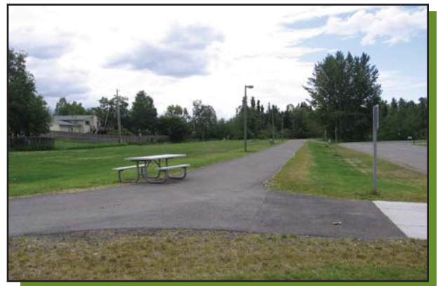
Trail repairs are needed