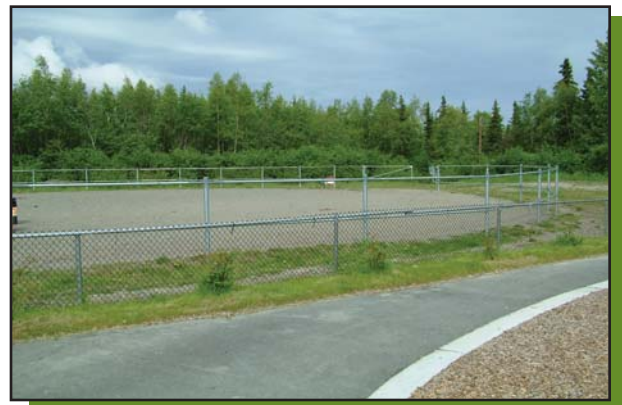
Neighbors identified needed repairs to park fences