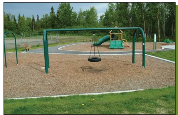
Additional wood chips are needed for safety surfacing in the play area

For a complete directory of Report Card results for neighborhood parks, go to www.AnchorageParkFoundation.org/projects/reportcard.htm