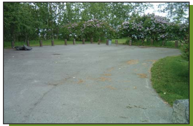
Users identified needed improvements in the park entry area