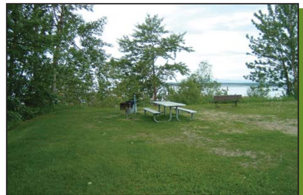
Tree trimming is needed to restore scenic views

For a complete directory of Report Card results for neighborhood parks, go to www.AnchorageParkFoundation.org/projects/reportcard.htm