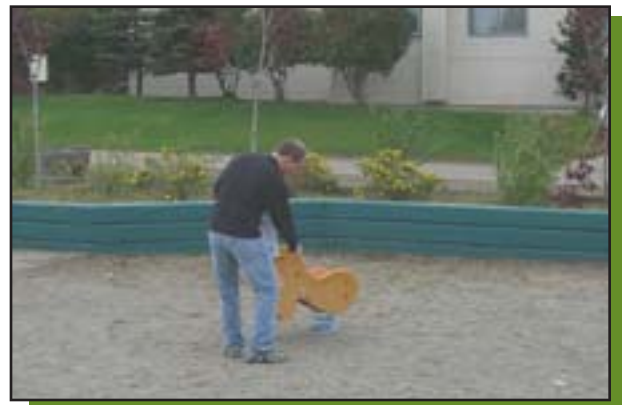
The play equipment is old and uninteresting