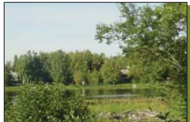
Lake Otis causes drainage problems in the park

For a complete directory of Report Card results for neighborhood parks, go to www.AnchorageParkFoundation.org/projects/reportcard.htm