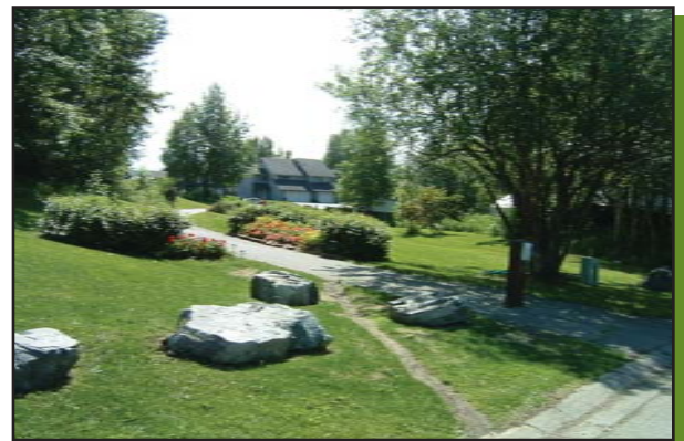
Informational signs are needed to improve access