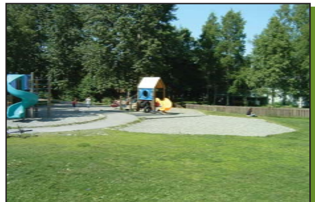
More gravel is needed for safety in the play area

For a complete directory of Report Card results for neighborhood parks, go to www.AnchorageParkFoundation.org/projects/reportcard.htm