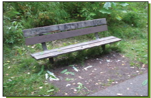
Benches are old and unattractive