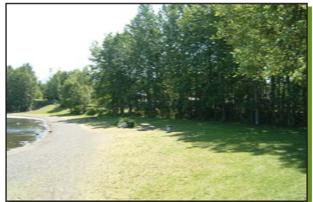
Additional trash cans are needed

For a complete directory of Report Card results for neighborhood parks, go to www.AnchorageParkFoundation.org/projects/reportcard.htm