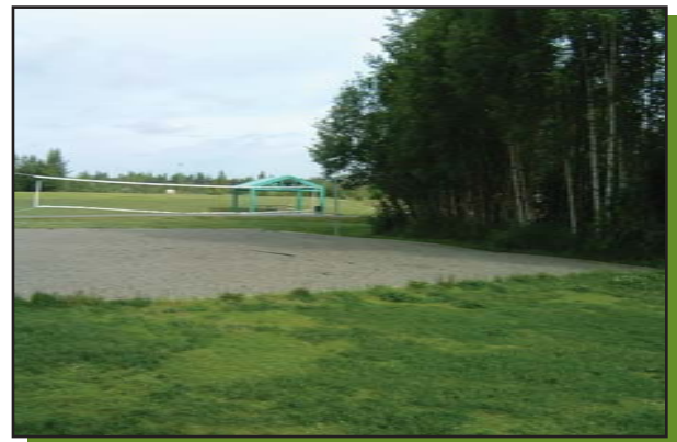
Users would like improved sight lines inside the park