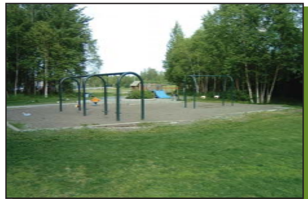
Playground and other amenities need graffiti removal

For a complete directory of Report Card results for neighborhood parks, go to www.AnchorageParkFoundation.org/projects/reportcard.htm