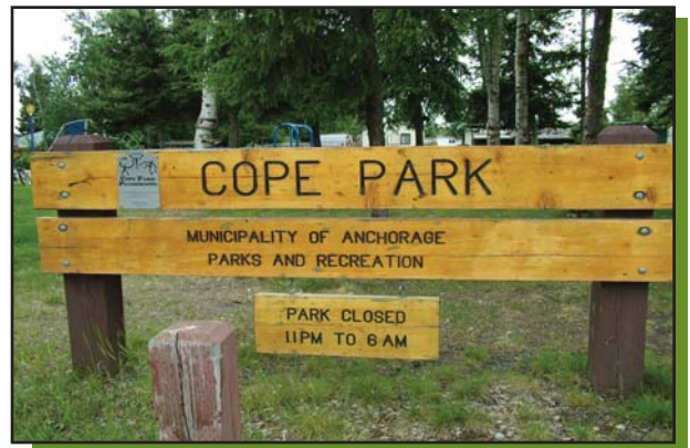
Neighbors requested improved signs and pathways to improve access