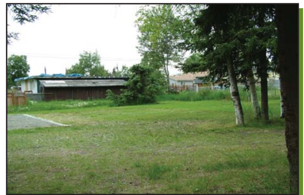
The parking area is muddy and sometimes unusable

For a complete directory of Report Card results for neighborhood parks, go to www.AnchorageParkFoundation.org/projects/reportcard.htm