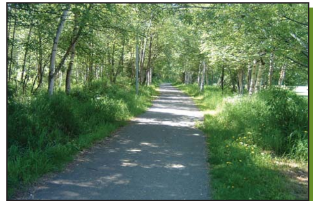
Improved sight lines are needed for user safety

For a complete directory of Report Card results for neighborhood parks, go to www.AnchorageParkFoundation.org/projects/reportcard.htm