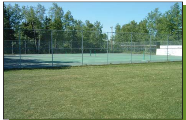
The neighborhood would like nets for the tennis courts