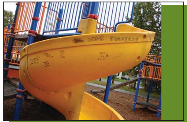
The neighborhood is concerned about the play equipment's safety and appearance

Participants were extremely concerned about visitor safety in Dave Rose Park, focusing specifically on overgrowth in forested areas, poor lighting, broken benches and tables, evidence of inappropriate activities and extensive graffiti throughout the park. Additionally, the wooden playground equipment is splintering. Participants also expressed a desire for more tables and benches for neighborhood use.