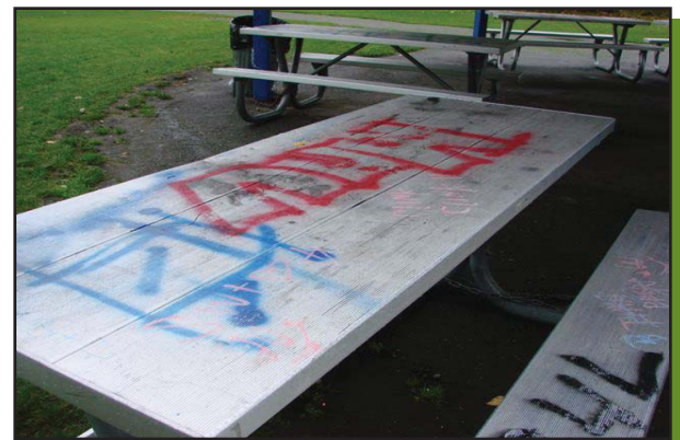
Graffiti is a problem throughout the park

For a complete directory of Report Card results for neighborhood parks, go to www.AnchorageParkFoundation.org/projects/reportcard.htm