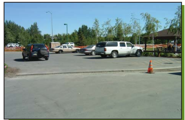
A crosswalk into the park is needed

For a complete directory of Report Card results for neighborhood parks, go to www.AnchorageParkFoundation.org/projects/reportcard.htm