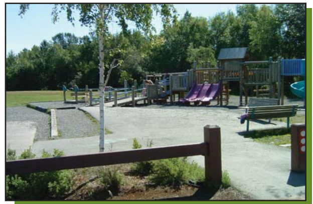
Neighbors are concerned about the play area edging