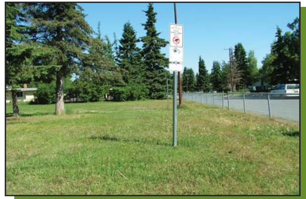
Neighbors requested improvements to park access