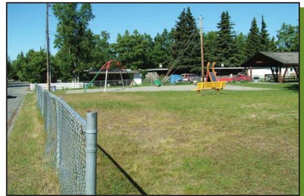
Park entry has limited pedestrian access

For a complete directory of Report Card results for neighborhood parks, go to www.AnchorageParkFoundation.org/projects/reportcard.htm