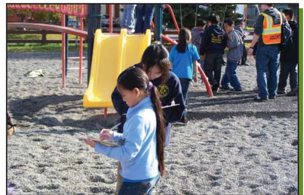
Students said that the play equipment needs to be cleaned and repaired

For a complete directory of Report Card results for neighborhood parks, go to www.AnchorageParkFoundation.org/projects/reportcard.htm