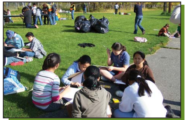
Local schoolchildren graded playgrounds in Duldida Park and William B. Lyons Park