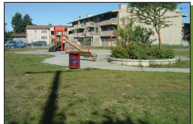
Graffiti is a problem throughout the park

For a complete directory of Report Card results for neighborhood parks, go to www.AnchorageParkFoundation.org/projects/reportcard.htm