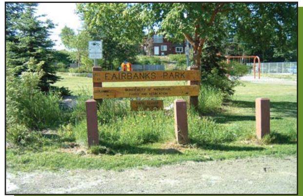
Users would like more frequent maintenance of planter beds

Fairbanks Park participants identified a wide variety of problems, including degraded play equipment and safety surfacing, poor maintenance practices, overgrown landscaping, graffiti, insufficient seating and a needed dog station. A recent Challenge Grant project added a fence to the perimeter of Fairbanks Park, improving safety conditions, but participants requested improvements to signs and fencing.