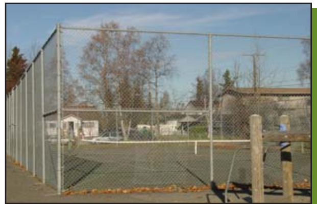
The tennis court surface is cracked and unusable