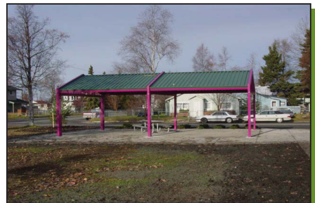
The picnic shelters need repainting and more tables

For a complete directory of Report Card results for neighborhood parks, go to www.AnchorageParkFoundation.org/projects/reportcard.htm