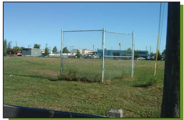
The neighborhood identified needed repairs to the ballfield