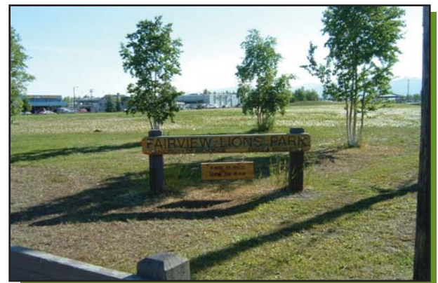
More informational signs are needed

For a complete directory of Report Card results for neighborhood parks, go to www.AnchorageParkFoundation.org/projects/reportcard.htm