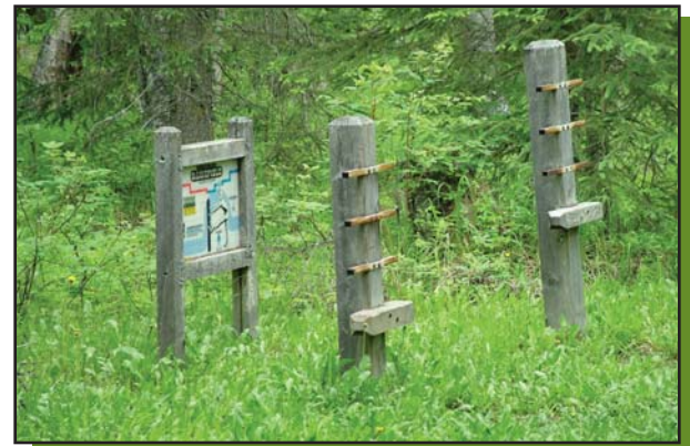
Fitness equipment also requires upgrades

For a complete directory of Report Card results for neighborhood parks, go to www.AnchorageParkFoundation.org/projects/reportcard.htm