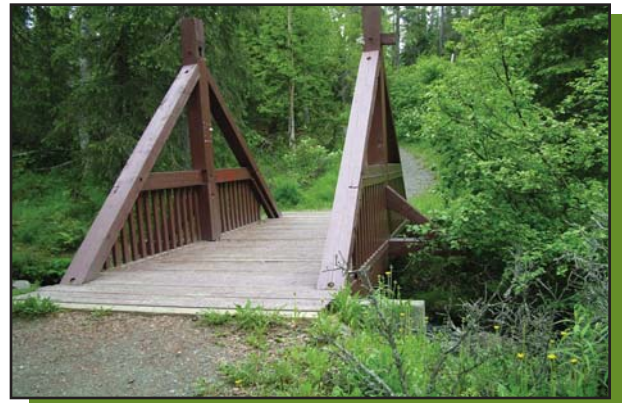
Participants are concerned about the condition of the bridge