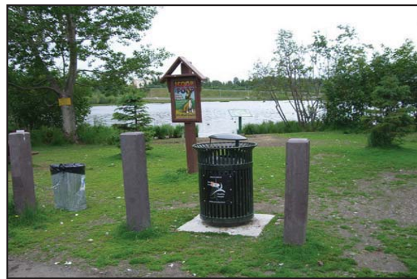
Additional trash cans are needed

For a complete directory of Report Card results for neighborhood parks, go to www.AnchorageParkFoundation.org/projects/reportcard.htm