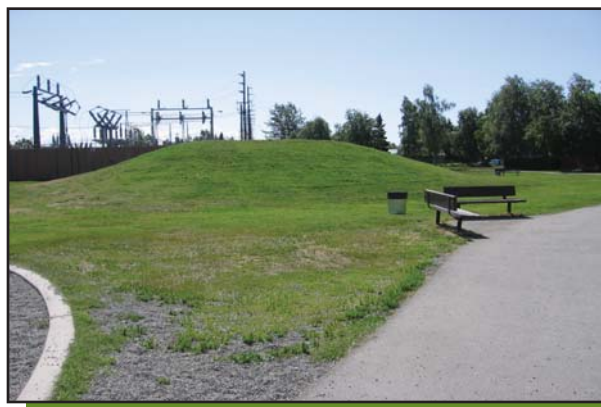
The neighborhood is concerned about poor maintenance of the park