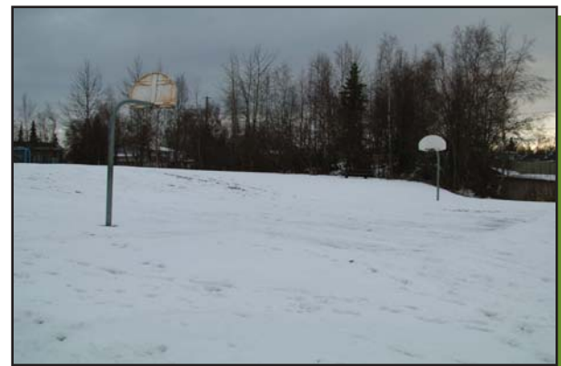
The basketball court is in need of repairs

For a complete directory of Report Card results for neighborhood parks, go to www.AnchorageParkFoundation.org/projects/reportcard.htm