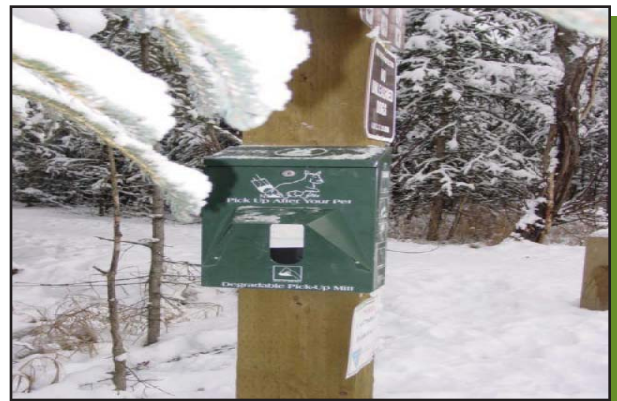
According to the neighborhood, the dog station is poorly located