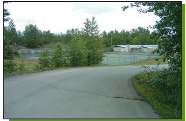
Neighbors expressed concerns about limited visibility

Report Card participants in Harvard Park were concerned about poor conditions in the active recreation areas, including cracked asphalt and missing nets. Community members also reported unsafe activities in the park, which are contributed to by poor visibility into the park. Other concerns included inadequate dog stations, trash cans or informational signs.