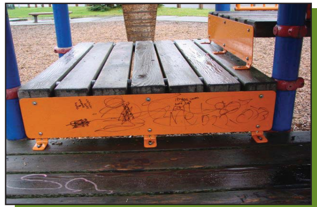
The neighborhood is concerned about the safety of the play equipment