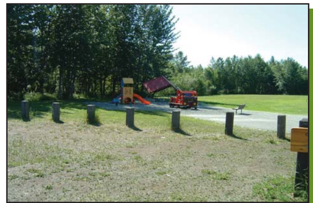
The parking area needs repairs

For a complete directory of Report Card results for neighborhood parks, go to www.AnchorageParkFoundation.org/projects/reportcard.htm