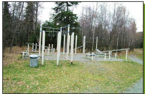
The neighborhood is concerned about the safety of the fitness equipment