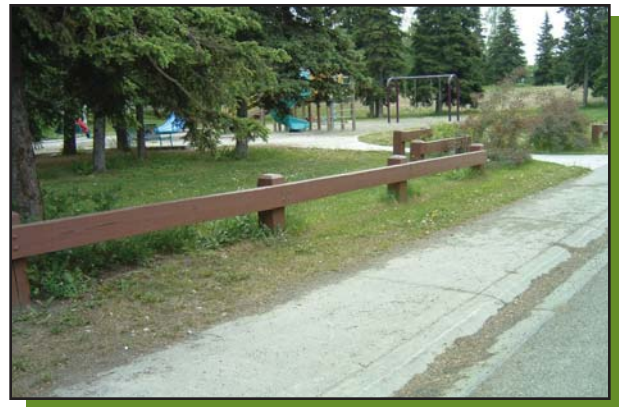
The border fence is in poor condition

Report Card participants at Kanchee Park were primarily concerned with creating a safe, secure park that is welcoming to visitors. Volunteers identified a variety of issues, including dead and dying trees, overgrown shrubs and weeds, inadequate trash cans and seating areas and broken pieces of play equipment.