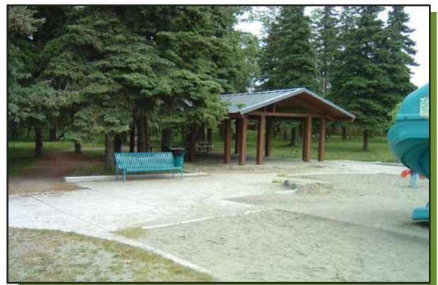
Graffiti removal is needed

For a complete directory of Report Card results for neighborhood parks, go to www.AnchorageParkFoundation.org/projects/reportcard.htm