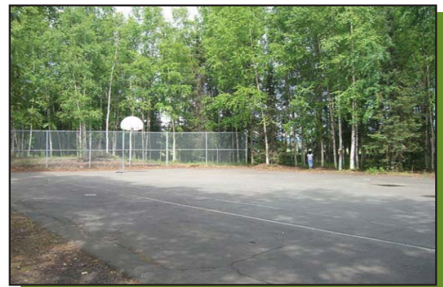
The basketball court needs repairs to restore functionality

For a complete directory of Report Card results for neighborhood parks, go to www.AnchorageParkFoundation.org/projects/reportcard.htm