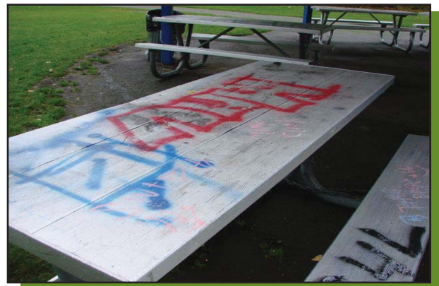
The neighborhood is concerned about graffiti in Kiwanis Fish Creek park